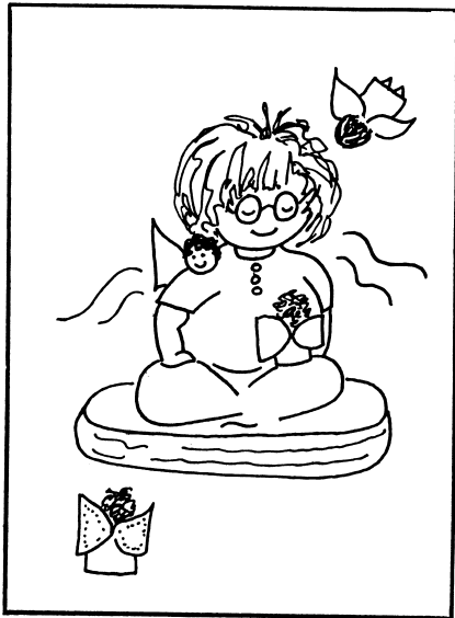
From: How To Bring Angels To Earth : "Dazzle the Sun"

Inside each book are 16 black and white illustrations. Anyone who colours the illustrations gets to play with us. We really like that!